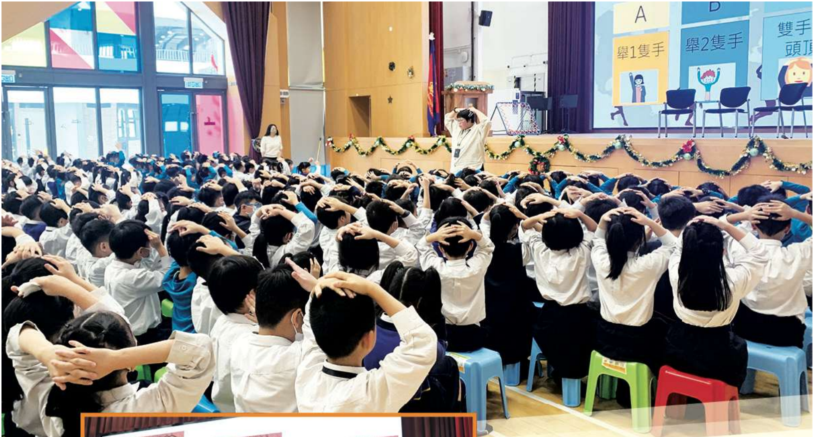
• 「成長型思維X堅毅」主題活動。