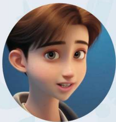
• AI 虛擬主播 — 夢想