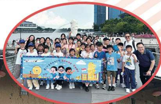
• Singapore Study Tour