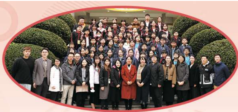
• 與廈門實驗小學締結為姊妹學校，師生前往當地進行交流。

為擴闊學生視野、增強學生自信和適應能力，本校積極推動國內、外的交流活動。透過參觀當地的名勝古蹟及參訪學校，讓學生親身體驗，建構可貴的學習經驗。